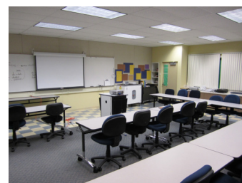
The Danford Technology Center at El Crystal Elementary School.